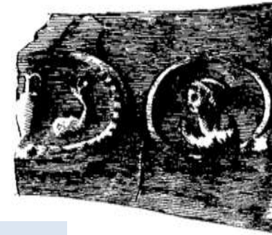
Punic silver headband discovered near Batna in 1879

This congress is held under the sign of Tanit, brandishing the caduceus of peace, with a background image of the Sea Peoples from a bas-relief in Medinet Habu, Egypt, depicting their battle against Ramses III in 1143 BC. The history of the transmission of medicine in the Mediterranean begins there, with a war between the Sea Peoples and the Nile people.